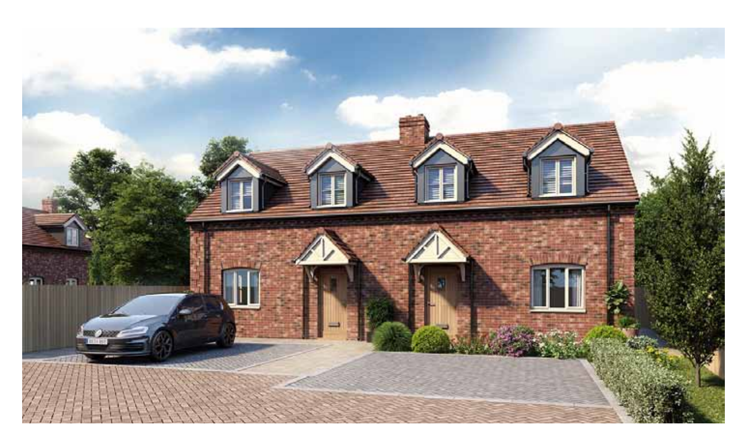
Homes Seven and Eight