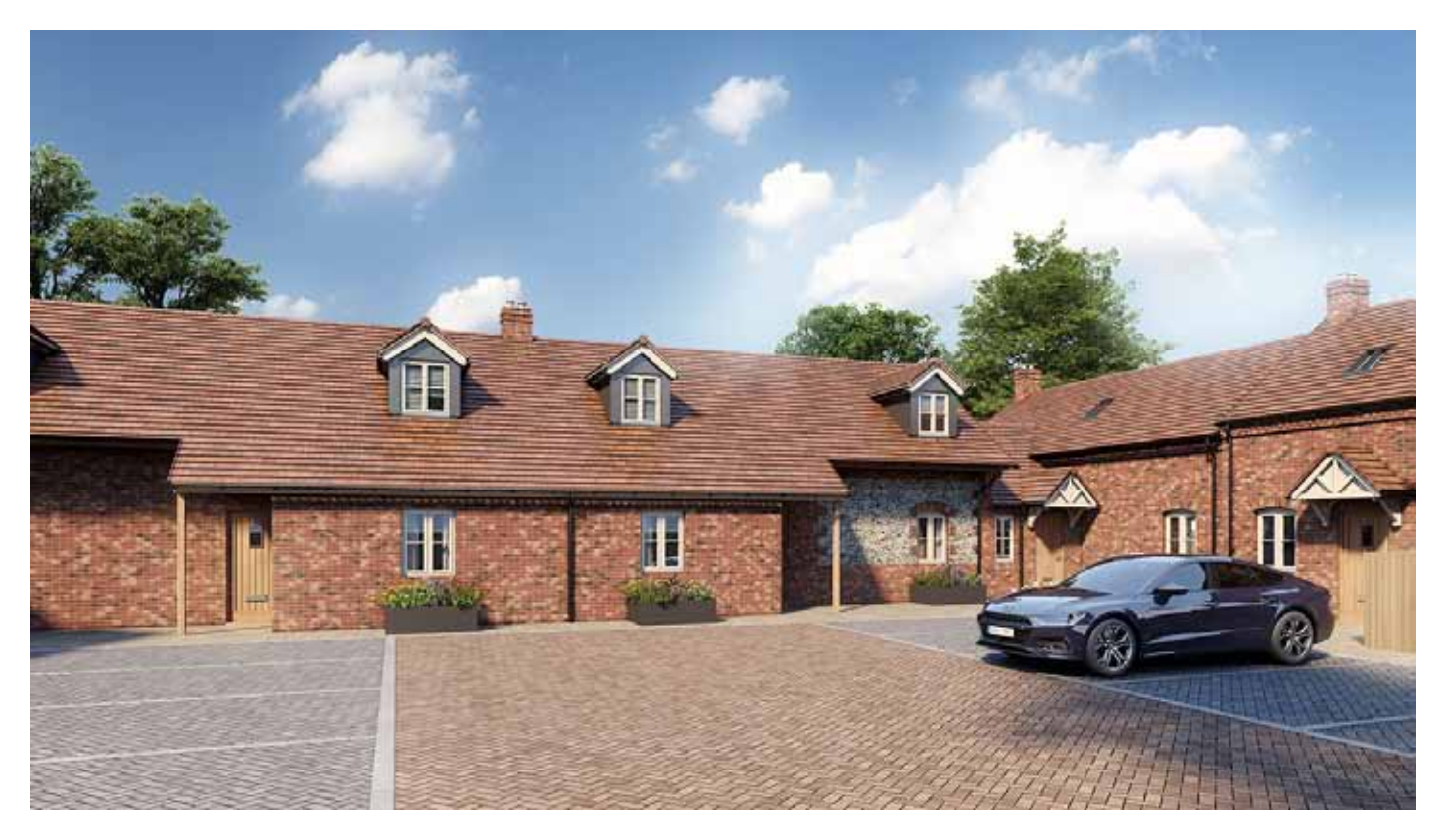
Homes Three to Six