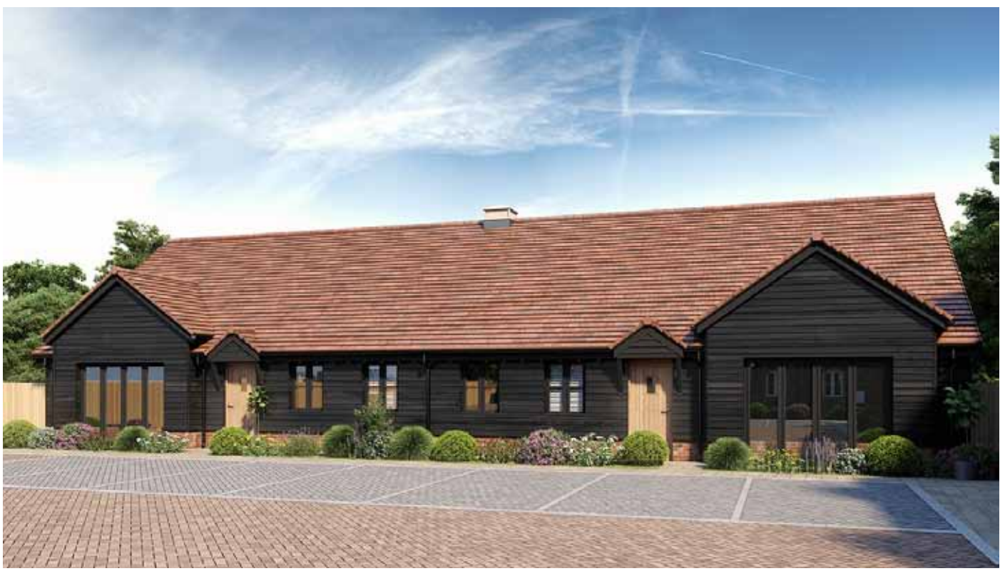
Homes One and Two